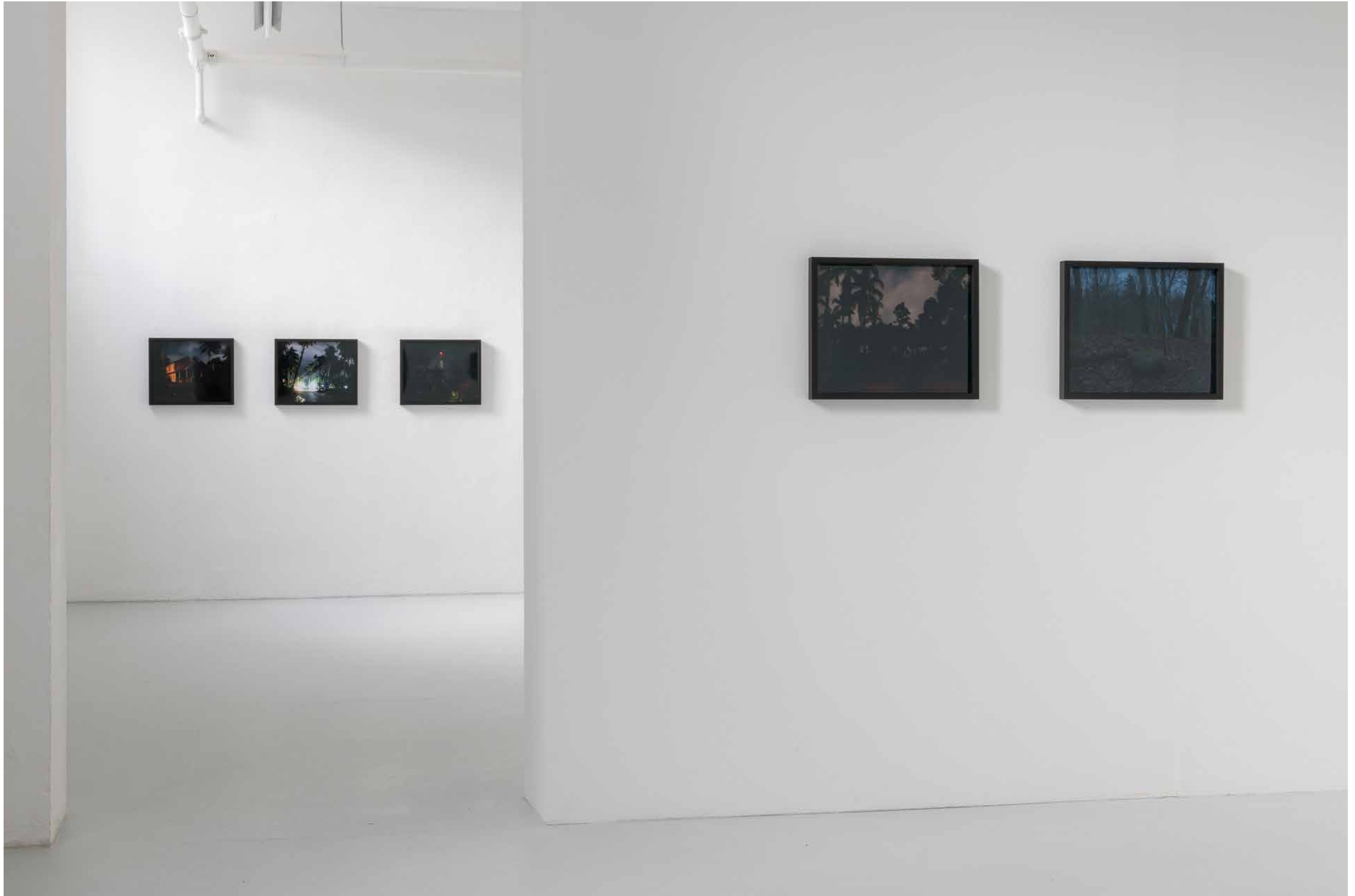
von links nach rechts: 17. ; 16. ; 15. ; 2.; 3.