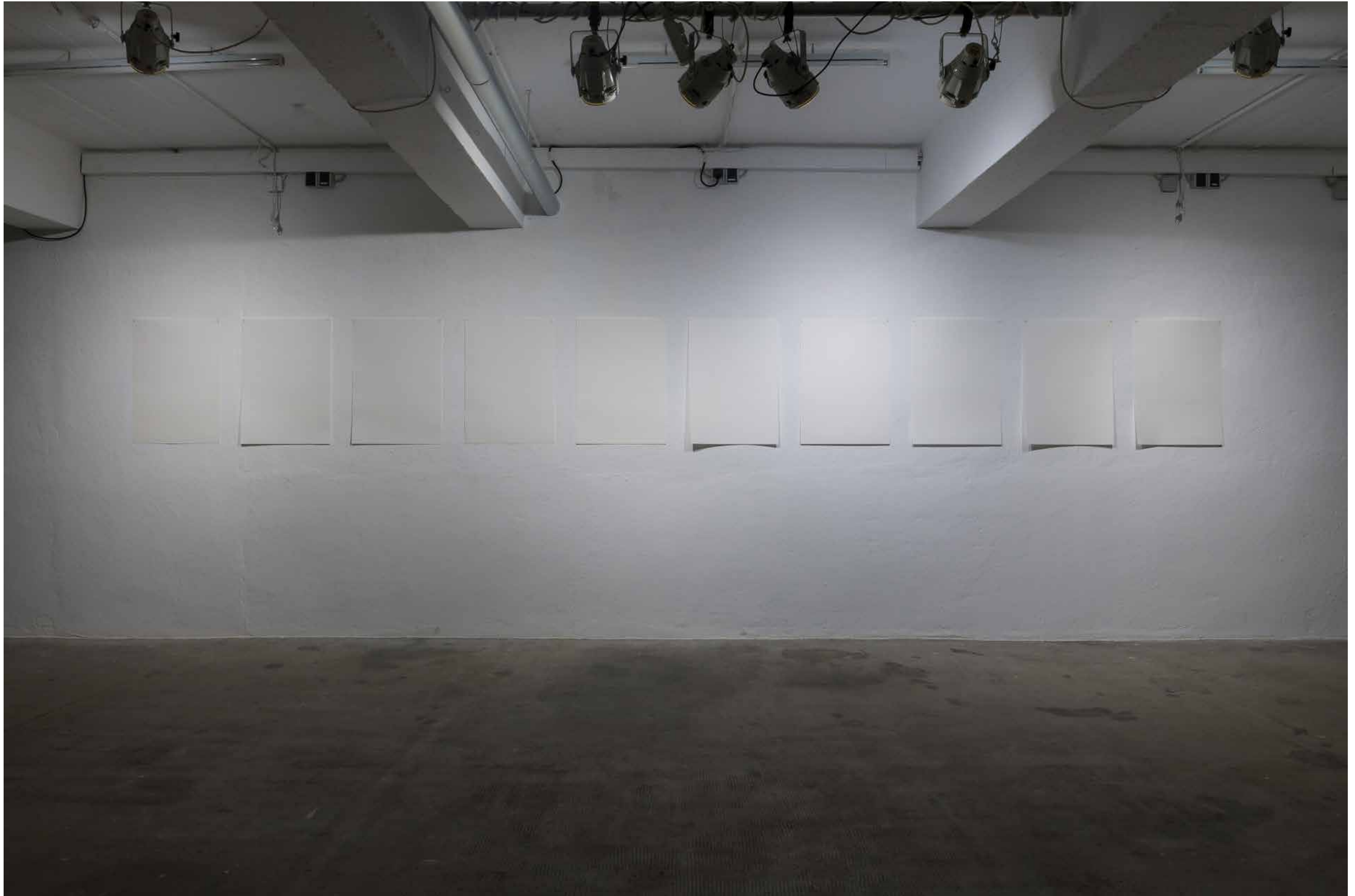
von links nach rechts: 2. ; 3. ; 4. ; (Interlude) ; 9. ; 10. ; 17. ; 18. ; 19. ; 21.