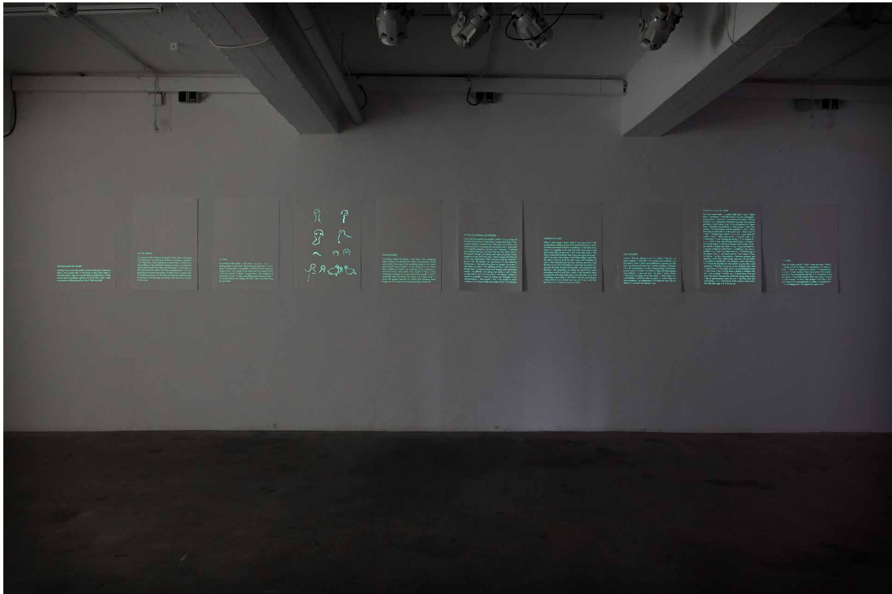
von links nach rechts: 2. ; 3. ; 4. ; (Interlude) ; 9. ; 10. ; 17. ; 18. ; 19. ; 21.